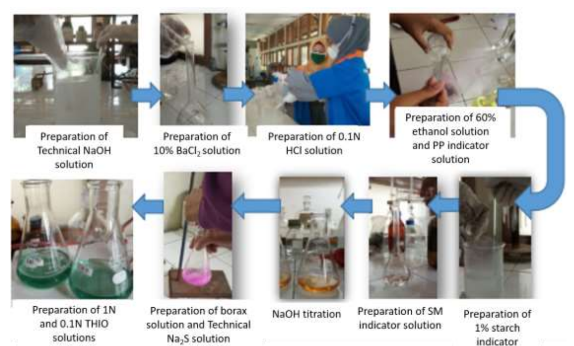
Figure 1. Process of making cooking solution

solution, technical Na_2S solution and making 1 N and 0.1 N THIO solutions. The process of making the cooking solution is shown in Figure 1.